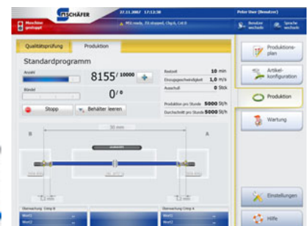
User interface WireStar20