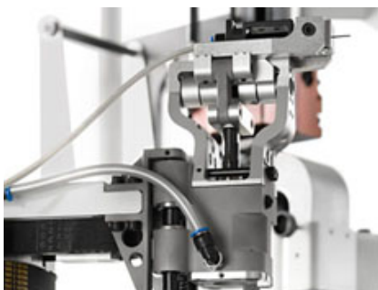
Adjustable wire guide system