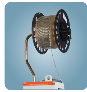
Revolving reel support bracket