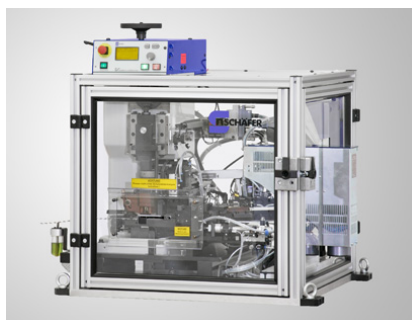
Utilized in the SSC