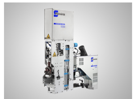
Utilized in the SSM